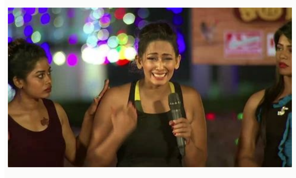
Arundhati tamil movie video songs download masstamilan. Arundhati tamil movie video songs.